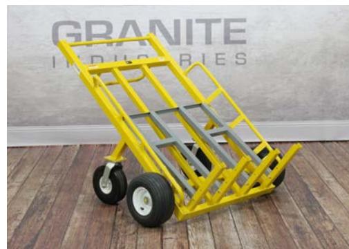
Adjustable wheel position.