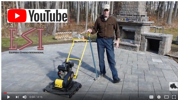
How To: Compact Concrete Paving Slabs 31,434 views