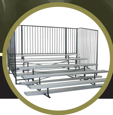
Granite Seating INDOOR/OUTDOOR SEATS

Granite Industries offers a wide range of everyday and specialty carts, hand trucks and dollies. Whether you need to move large items such as tents, inflatables, chairs, tables, drywall, staging or fragile items like glasses and dishware, we've got the right cart for the job.