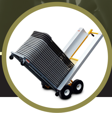
Granite Carts STORAGE + MOVING SOLUTIONS

In addition to staging, Granite has a full range of scaffolding, indoor/outdoor seating along with crowd control products to handle all of your event needs. Keep your event staff and attendees safe with quality, durable products, each designed to handle specific applications. Granite also offers carts, dollies, hand trucks plus many specialty items, including electric powered carts, wagons and wheelbarrows for transporting staging and equipment.