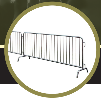
Granite Crowd Control Fencing 8 FOOT BARRIERS

Select from three styles of seating: Bench, Bench with Back and Flip Up seat with Back.